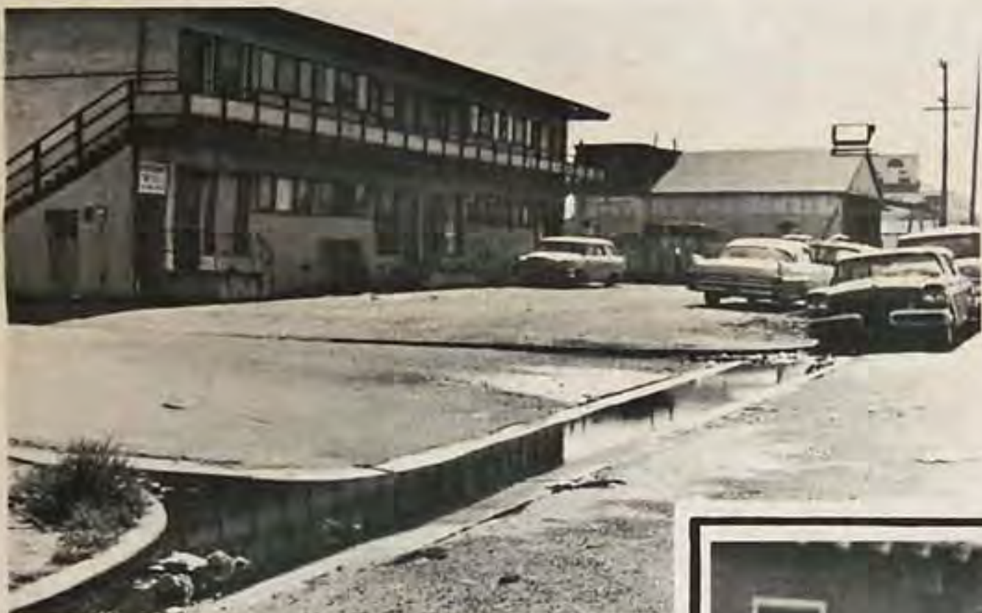
THIS IS WHY NORTH RICHMOND IS BLACK PANTHER TERRITORY. GUNS IN THE HANDS OF BLACK MEN CAN CHANGE ALL THIS. GUNS. GUNS.

The heirs of Malcolm now stand millions strong on their corner of the triangle, facing the racist dog oppressor and the soulless endorsed spokesmen. The heirs of Malcolm have picked up the gun. And, taking first things first, are moving to expose the endorsed spokesmen for the black masses to see them for what they are and always have been. The choice offered by the heirs of Malcolm to the endorsed spokesmen is to repudiate the oppressor and crawl back to their people and earn a speedy reprieve or face a merciless, speedy and most timely execution for treason and being too wrong for too long.