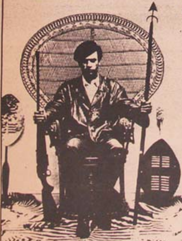
MINISTER OF DEFENSE

BUTTONS 50¢ ea 6 for $1.00 ORDER BY NUMBER